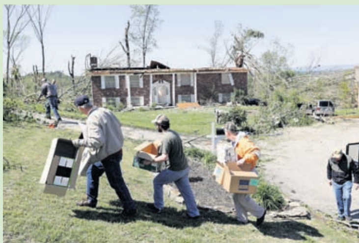
Workers carry boxes to a storm-damaged home Tuesday, April 14, 2020, in Chattanooga, Tenn.

Workers are still trying to provide all the comfort they can, but from a distance. Within hours of the tornado onslaught, which began Sunday, church groups were out in affected communities, and